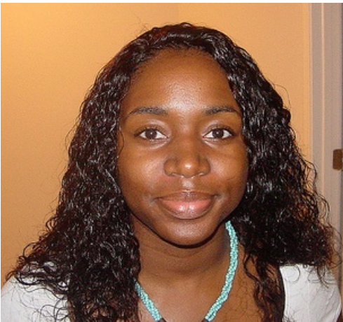
These photos were borrowed from internet sites. I like the one below, because it's a good close-up image of the concept to achieve this look.