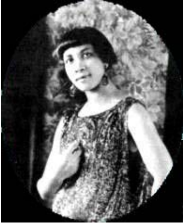
IDA COX Vocalist, composer, recording artist

Reprint of a Biography posted on allaboutjazz.com